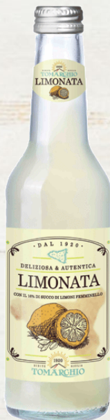
Lemonade Glass 275 ml

Simple and everlasting recipe, Spuma is the most loved blonde by Sicilians. The wise combination of aromas based on herbs gives it a characteristic scent of raisin, making it a great classic capable of satisfying the most demanding palates.