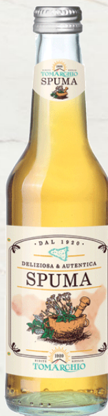
Spuma Glass 275 ml

Fresh and dry taste. Its full and persistent flavor is accompanied by a light note of lemon. In Etna water. With cinchona bark extract and Sicilian lemon juice.