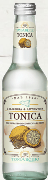
Tonic Glass 275 ml

Fresh and dry taste. Its full and persistent flavor is accompanied by a light note of lemon. In Etna water. With cinchona bark extract and Sicilian lemon juice.