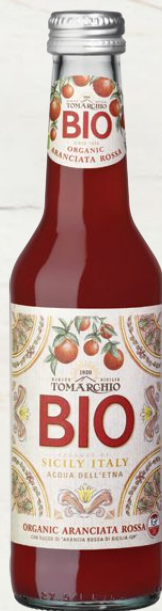
Organic Red Orangeade

With “Syracuse Lemon PGI” juice For many but not for all! Our Cola BIO, very Sicilian, is characterized by a unique and particular taste. The aromatic intensity of the nut cola contrasts with the rich and intense aroma of “Syracuse Lemon PGI”.